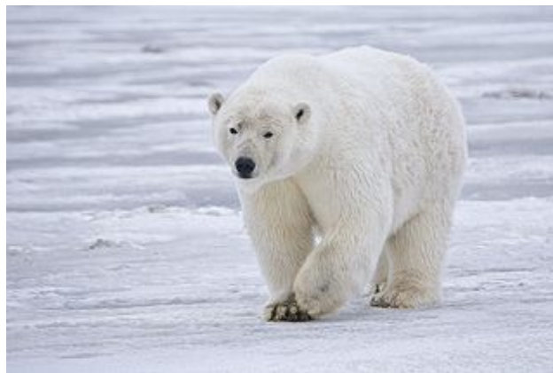
Figure 1: Polar Bear.

For this question, include an image of the animal you added to the table in Q5 along with a caption (see example below).